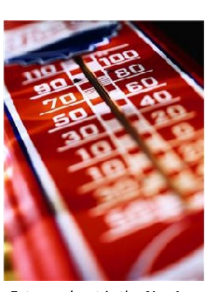
Extreme heat is the No. 1 non-severe-weather-related killer in the U.S.

The effort was widely viewed as a prime example of coordinated, risk-based emergency planning.