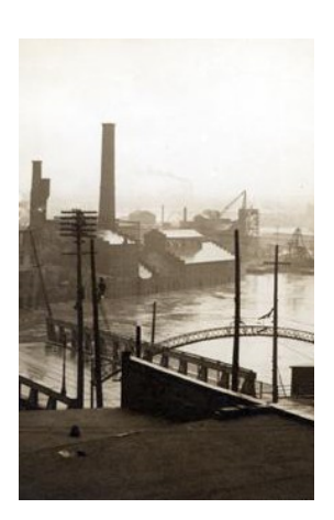
Flooding is the No. 1 risk for Franklin County.