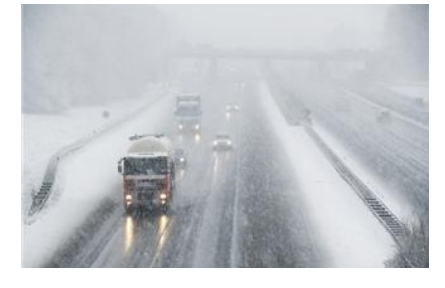
Severe winter weather is the No. 2 risk for Franklin county.

The updated assessment brought positive attention from the U.S. Department of Homeland Security.