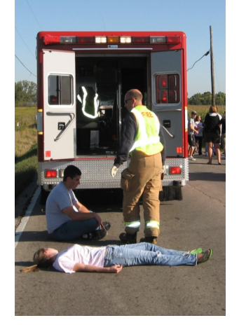
Victim, responder roleplayers in IED field exercise in September

The exercise validated the counties' emergency operation plans and allowed participants to evaluate current response concepts, plans and capabilities in the event of a terrorist incident.